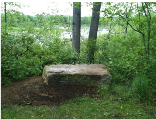
The Deedee Stone