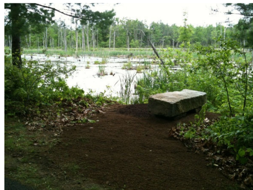
The Sally Stone